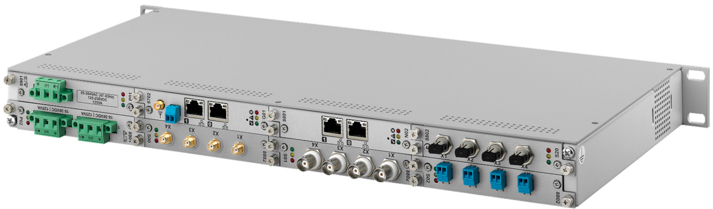
Rear view of fully equipped base system FG8101G01 with redundant power supplies FG8901P01 and FG8901P02, time domain controller board FG8702G01 and service provider boards FG8801N02, FG8802S00, FG8802S01, FG8802S02 and FG8802S20

Article numbers without the suffix '-B000' are considered spare parts where each component is delivered in individual packaging.