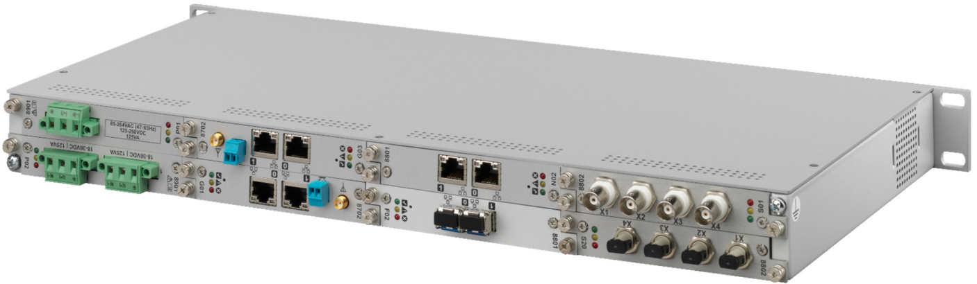
Rear view of fully equipped base system FG8101G01 with redundant power supplies FG8901P01 and FG8901P02, redundant time domain controller boards FG8702G01 and FG8702G03 and service provider boards FG8801N02, FG8801F02, FG8802S01 and FG8802S20