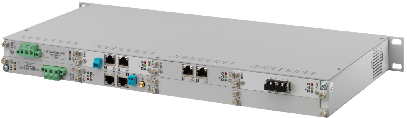
Rear view of base system FG8101G01 with redundant power supplies FG8901P01, management controller board FG8800M00, time domain controller board FG8702G03 and service provider boards FG8801N02 and FG8801F02